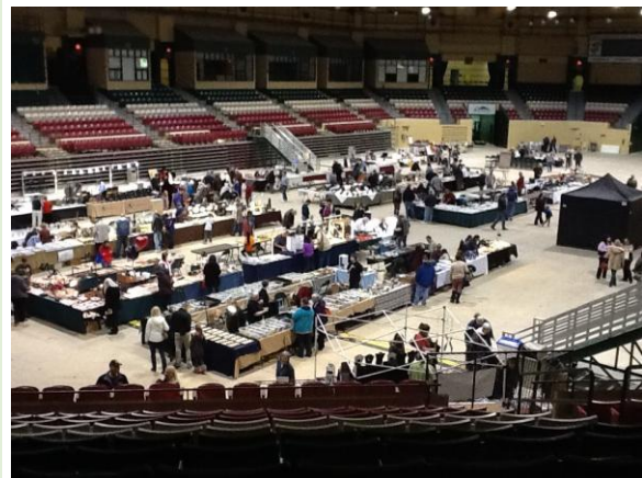
February 2015 SMRMC Rock, Mineral, and Fossil Show