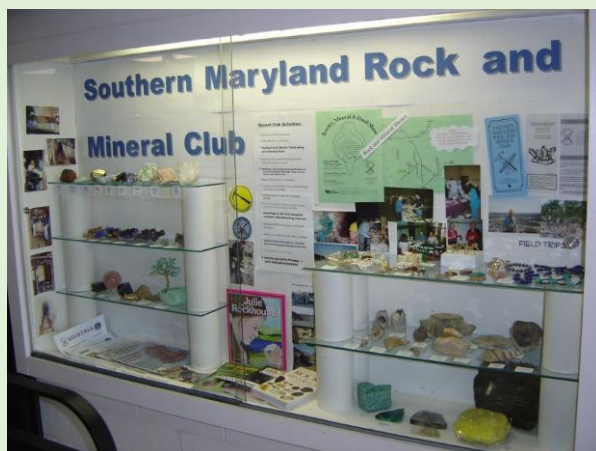
Laplata Library Display

ALSO - Remember AUGUST is the traditional CLUB AUCTION . Next month promises to be the start of discussions on the event concluding with the final details to be hashed out in July. Stay tuned for the details!!!